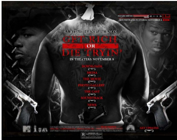
GET RICH OR DIE TRYIN'- WEB SITE GRAPHIC