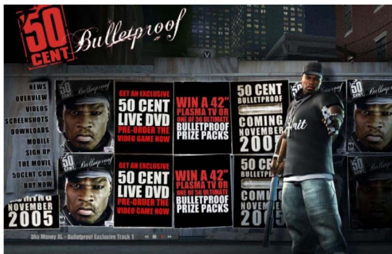
50 CENT VIDEO GAME - WEB SITE GRAPHIC

to ensure that Get Rich or Die Tryin' does not receive tax credits from the province of Ontario. People living with gang violence should not be forced to fund movies that contribute to that violence. Federal politicians should take similar action to forbid the granting of federal tax credits.