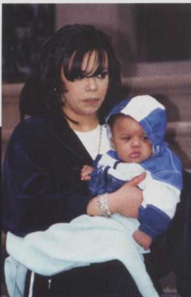
THINGS DONE CHANGED: Since Big's death, Faith Evans has taken a public stance against domestic violence.