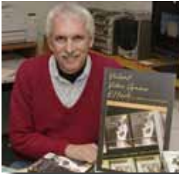
Professor Craig Anderson

will provide teachers with practical tools and skills specific to their grade/course/level. A broad range of workshops will be included in the program to meet the varied interests and needs of participants.